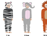
1 hr 5 hrs 10 hrs

Motivate your pupils to gain points to dress their avatar and encourage them to compete against buddies on the leaderboard.